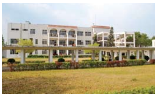
B.P. Koirala Memorial Cancer Hospital.

Nepal is a small Himalayan country situated between India and China. It is landlocked, and stretches to 800 kilometers in length and just 241 kilome-