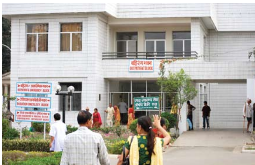
BPKMCH Outpatient Block.

B.P. Koirala Memorial Cancer Hospital (BPKMCH) is in Bharatpur, a city 150 kms south of Kathmandu, and the only government cancer hospital in Nepal. It was built in the memory of (and named after) Bishweshwar Prasad Koirala who was the first democratically elected Prime Minister of Nepal. Unfortunately, he died of throat cancer. Founded in 1992 with Chinese assistance, the hospital started offering outpatient services in 1995 and began treating inpatients in 1999. It provides diagnostic, therapeutic and supportive services for cancer patients and has specialists in medical oncology, radiation oncology, surgical oncology (including neurosurgery, and head and neck surgery), gynecological oncology, radiology, pathology, preventive oncology and hospice care. There is a