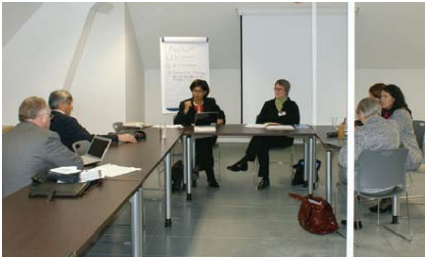
Working group discusses formation of INCTR nursing program at INCTR 10th Anniversary meeting.

Educational Consortium (ELNEC) confirmed that the INCTR project would help fill a gap in international nursing palliative care education, and was met with enthusiastic support.