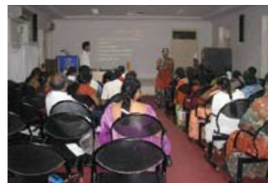
Nurse assistants at MNJ undergo training in palliative care.

Through the concerted effort and support of the medical oncologist and the department team we have started a unique pain relief and palliative care program for children. Almost every child with cancer in the hospital is enrolled in the program from day one. In 2009 we cared for 1532 children, of whom 365 were new patients. 66 gms of morphine were consumed during the last six months.