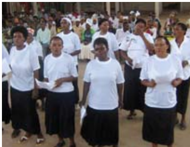
Graduates sing for their guests.

Eastern and Southern Zones' heads of government health facilities, and training for 30 healthcare workers from Kinondoni municipality. These initiatives generated a lot of enthusiasm among our palliative care team members who continued with the work even after the grant was exhausted.