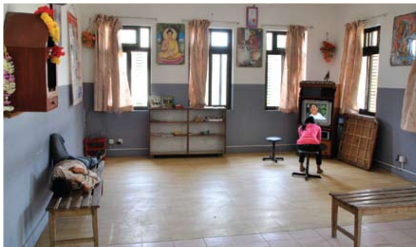
Palliative care unit family lounge.