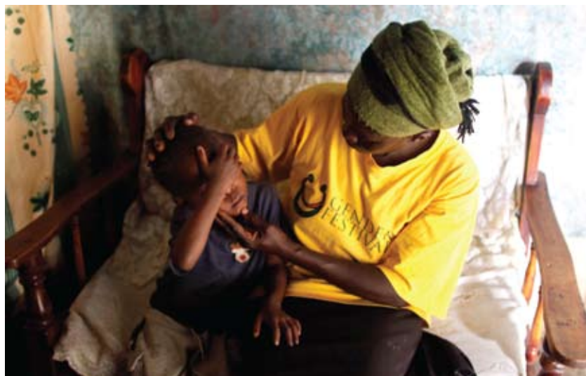
A community health worker checks on a child during a home visit in Mathare, Nairobi, Kenya