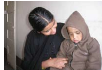
The little patient at his first visit.