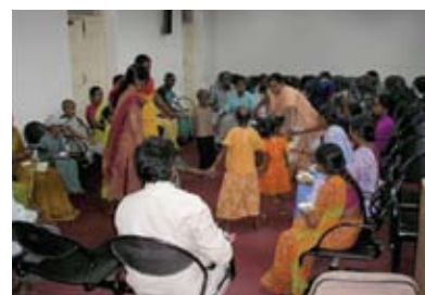
Support group meetings help families and patients cope with childhood cancer.

The palliative care team offers pain relief to children during interventions for diagnosis and treatment, regular support-group meetings for families and children, active supportive and end-of-life care, and psychosocial and bereavement care. Two social workers, funded by NATCO Pharma Trust, work exclusively with the children. The early intervention has helped in improving compliance and reducing the treatment drop-out rate. There is now a smoother transition to end-of-life care and improvement in the overall quality of care for children and their families.