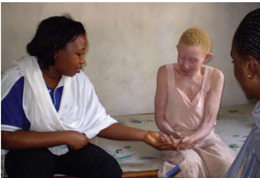
A nurse with ORCI's palliative care team makes a home visit.

tions that can be prescribed, meaning that gravely ill patients in chronic pain have to regularly visit their doctors to obtain new prescriptions.