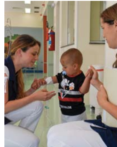
Multidisciplinary health professionals working with children and teenagers.

vided palliative care advice to doctors and other health professionals working in the Santa Marcelina Complex.