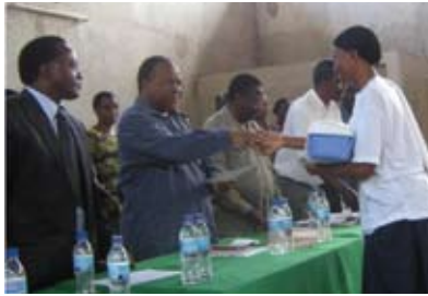
Graduates receive PC certificates.

puter and LCD projector for the palliative care office at ORCI. It also helped meet the office operating costs, and allowances for the program director and secretary for a year. In addition it paid for a sensitization workshop for