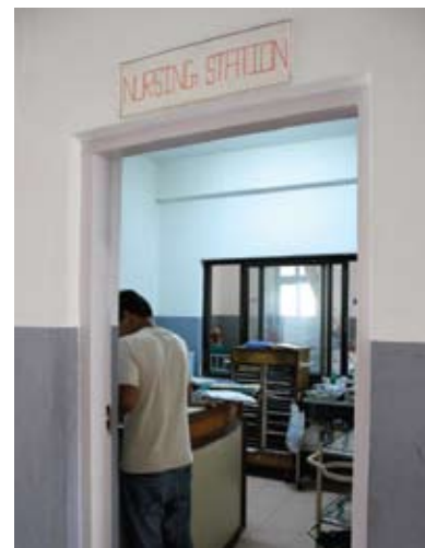
Palliative care unit nursing station.

on Cancer (IARC) and the International Union Against Cancer (UICC). With the support of IARC and UICC International Cancer Technology Transfer Fellowships (ICRETT), many doctors, nurses and technicians have received training in the prevention, diagnosis, treatment and palliative care of cancer patients.