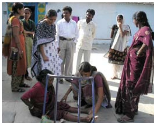
MNJ has taken palliative care to the community—here, an outreach program in a village near Hyderabad.

Flashback. Year 2003. The bustling city of Hyderabad with its minarets and lake-rimmed skyline. 10,000 patients suffering from cancer, with fewer than 200 accessing palliative care. Flash forward. Year 2010. The same city, with one marked difference—accessible