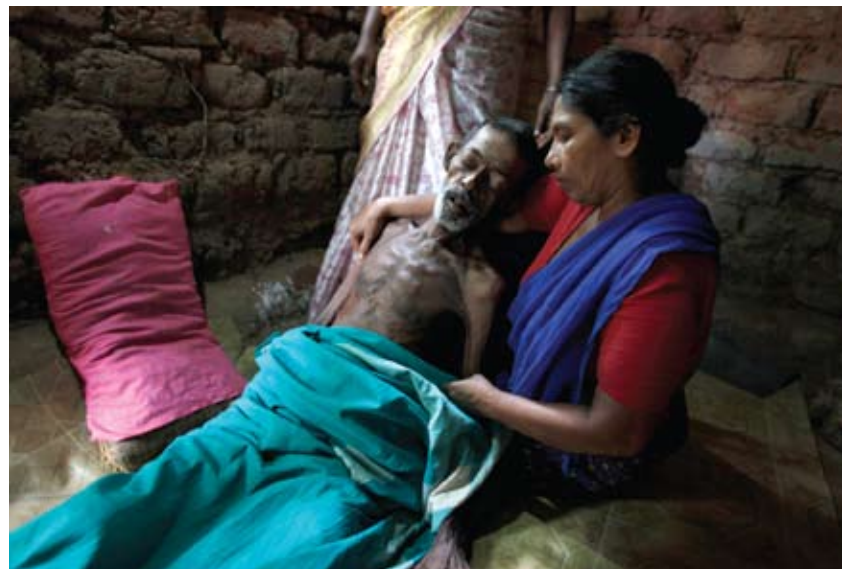
A 55-year-old woman holds her husband, a 67-year-old lung cancer patient. He receives palliative care and pain treatment from an NGO in South Kerala, India.