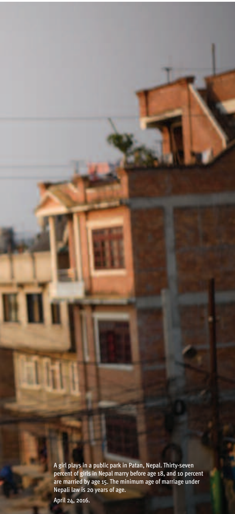
A girl plays in a public park in Patan, Nepal. Thirty-seven percent of girls in Nepal marry before age 18, and 10 percent are married by age 15. The minimum age of marriage under Nepali law is 20 years of age. April 24, 2016.

Thirty-seven percent of girls in Nepal marry before age 18 and 10 percent are married by age 15, in spite of the fact that the minimum age of marriage under Nepali law is 20 years of age. Boys also often marry young in Nepal, though in lower numbers than girls. UNICEF data indicates that Nepal has the third highest rate of child marriage in Asia, after Bangladesh and India.